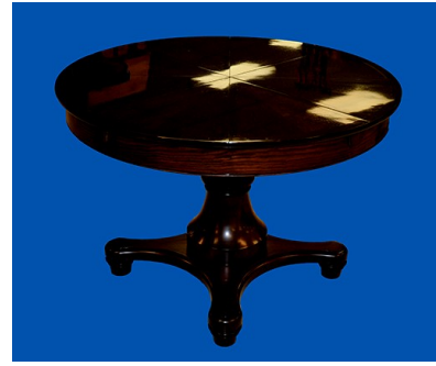
Oval Table by Tom Smoller Made with ash & maple Finished polyurethane Point of interest design