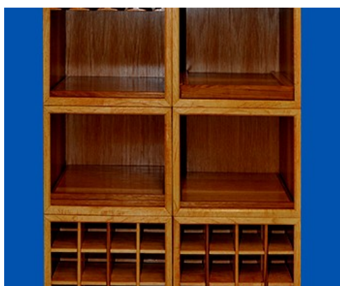
Wine Rack by Jerry Stanley

challenges shaping handle after glue up, should have band sawn first!