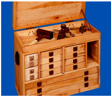
Tool Box by Pete Cavo made with maple

made with ash, basswood, cedar, walnut, finished with fiberglass Mas -epoxie challenges bent shafts