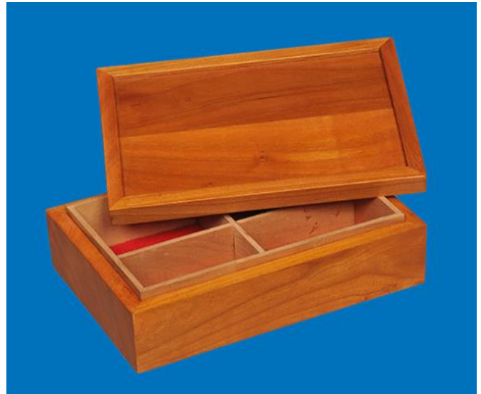
JSergio Rodriquez