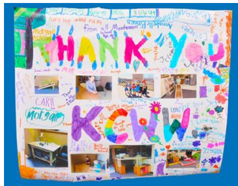
Smithville Montessori