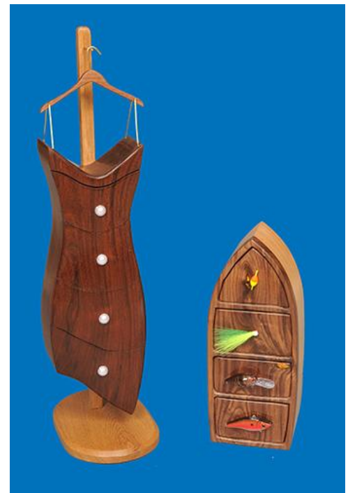
Jim Ramsay