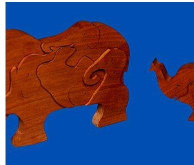
Elephant and Baby by Spring Fisk made with walnut