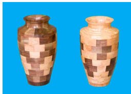
Bud Schenke- Segmented Vases *