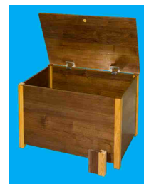
Jim Stuart- Walnut & Ash Toy Box