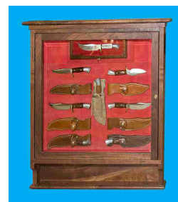
Bill Bysel- Knife Collection Display Cabinet