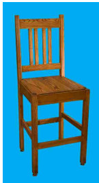
Clifford O'Bryan- Kitchen Island Stool *